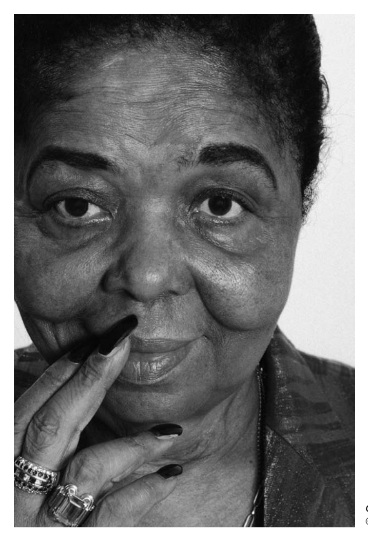
Cesária Évora . Photograph. © Lusafrica

Africa" figure, barefoot and close to nature, dressed in a loose West African bubu , her face wrinkled and distorted by years of work and worry, solitary on a stage or surrounded by younger male musicians, singing of sorrow and longing in a deep, contralto voice.