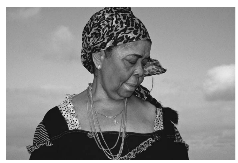
Cesária Évora . Photograph.