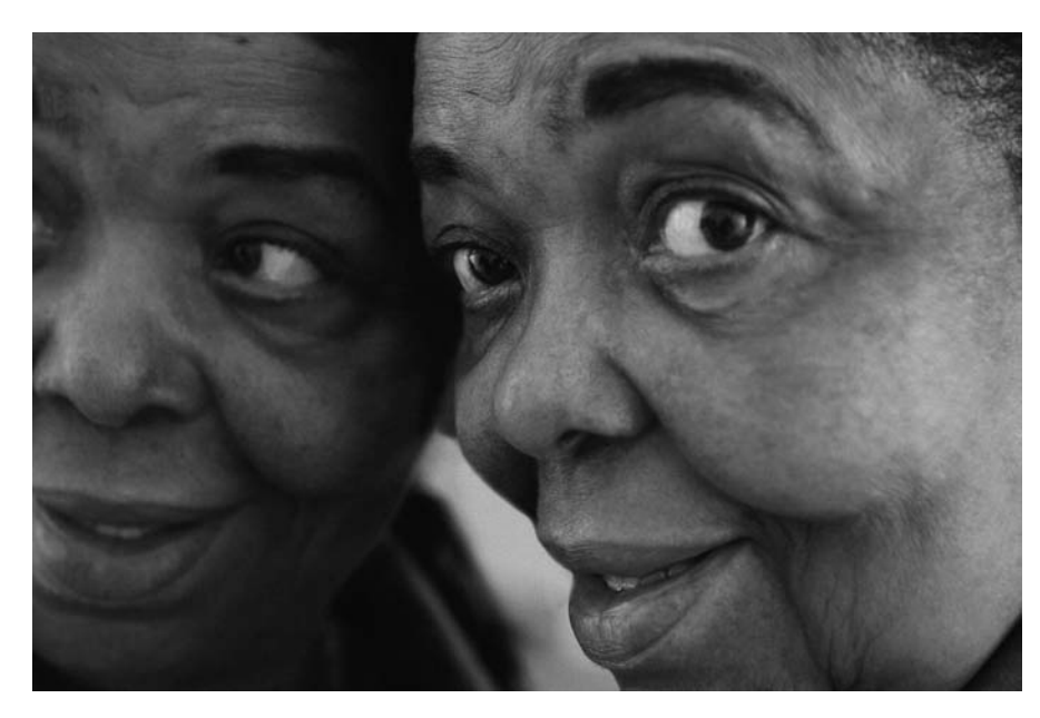
Cesária Évora. Photograph. © Lusafrica

poetic and artistic minds to grace the nation. It is a more recent development to see formal recognition of the accomplishments of women performers like the folk singer Ana Procópio, finason performer Nha Nasia Gomi, Cesária, and other vocalists recording contemporary work.