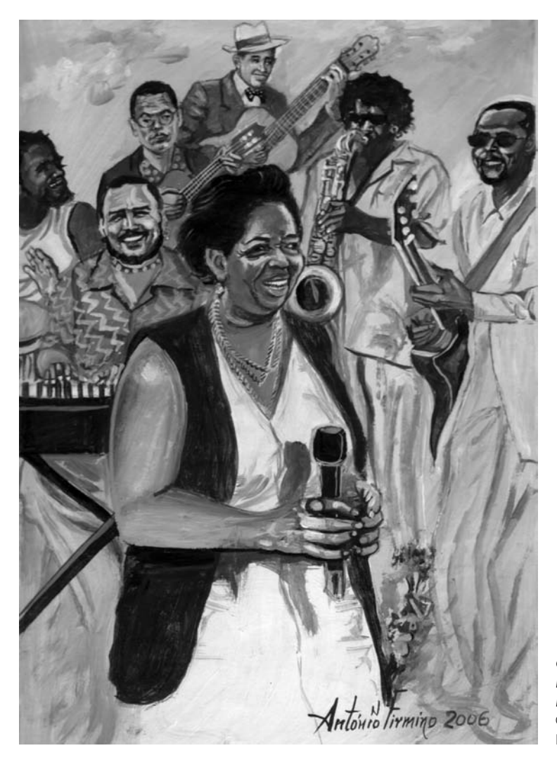
Cesária e a Sua Banda [Cesária and Her Band].

[violin], violão [guitar], and cavaquinho [a small Portuguese stringed instrument], though this arrangement is flexible, especially with increased availability of electronic instruments. Each of the genres is organized into musical strophes that alternate with a refrain, making group or call-and-response audience participation common.